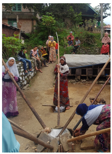
Fig 6. Alu Katentong audience

Katentong are usually children, adolescents, adults, and the elderly. Basically, audiences who want to enjoy the Alu Katentong art show are allowed from various backgrounds and ages.