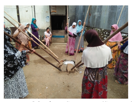
Fig 4. Alu Katentong Costume at Marriage Ceremony

4. Costumes and Makeup: Costumes are clothes or clothes that are used during art performances. In the context of the marriage ceremony, the players of the Alu Katentong art only wear everyday clothes such as household clothes, but during certain traditional ceremonies all the players wear black bundo kanduang clothes complete with tingkuluak (head cover), salempang, sarung, and wear make-up simple one.