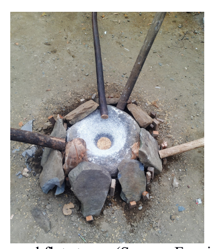
Fig 2. Alu, lasuang, and flat stones

2. Instrument: Instrument is a tool that was created to produce sound. Types of tools in the art of Alu Katentong include musical instruments that are not pitched. The tools used came from Alu, lasuang, and flat stones. The alu is pounded on a flat stone arranged around the lasuang to produce a loud enough sound. Alu used comes from the surian tree with a diameter of 10 cm with a length of 3.75 meters. The surian tree that is chosen to be used as a alu must go through a drying process. Drying is done by placing the wood on top of the selayan or pagopian of a burning stove. The surian wood is left in the pan for several days until the water fibers contained in the wood are completely dry. The drier the alu is used, the clearer the sound will be. Apart from alu, lasuang is also used as an instrument in the art of Alu Katentong. Lasuang is a stone that is used as a container for laying rice. Lasuang is obtained from a tributary located not far from the settlement of the Padang Laweh community. Lasuang can be found on every yard of the Minangkabau traditional house in Padang Laweh. The next instrument is a flat stone. Flat stones are arranged around the lasuang that have been implanted in the yard of the Minangkabau traditional house. This stone becomes a medium for pounding for the Alu Katentong players so that it produces a loud sound.