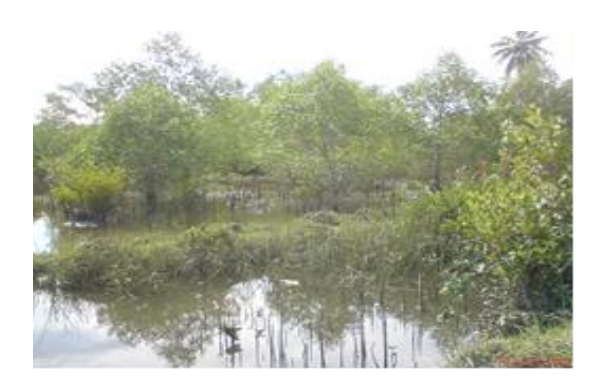
Picture 1. Mangrove Plants of Sonneratia caseoloris and Aegiceras corniculatum on the Field of Pond Pond Trench Empang Pattern in Batang Gasan District.

The extent of mangrove forest distribution in Batang Gasan Sub-district based on the Padang Pariaman Regency's Maritime and Fisheries Service (2009) reached 40.70 ha, spread over two locations, namely Nagari Gasang Gadang with an area of 35 Ha and Nagari Malai V with an Area of 5.70 Ha. The coastal and coastal areas of Batang Gasan District are affected by two seasons, namely the rainy season and the dry season. The rainy season occurs from November to May, while the dry season is from June to September. Batang Gasan District has climate type A with an average rainfall of 2,013 -3,399 mm per year. The average temperature of 26.7 C with a difference in the maximum and minimum temperatures ranging from 81% - 86% and 100% sunlight range of 8 hours