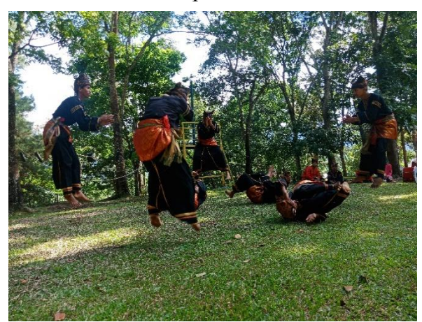
Fig. 3 One of the creation movement galembong tapuak during the process of group exercise Barapi Mudo (Doc. Astri Novrita Nababan, 2020)

The structure of the randai performance performed by the group Mudo Barapi begins with the playing instruments of the musical talempong pacik and gandang to accompany the opening of the players entering the arena/ venue. The opening pasambahan is accompanied by opening chant Dayang Daini's and ended with tapuak galembong . Next, the transitional drum Simarantang Randah is performed, which delivered every transition of the story scenes in the randai , ending with tapuak galembong. Each dendang is performed according to the story being played. If the atmosphere of a mourning story is performed, the dendang ratok sung, while the dendang is rhythmic or cheerful if the story is happy. The closing movement is done again before ending Randai 's performance. Finally, the dendang is Simarantang Tinggi performed to accompany the sambah closing that ends or closes the story randai . Talempong pacik is then played back to accompany the players leaving the arena/ venue for the performance randai .