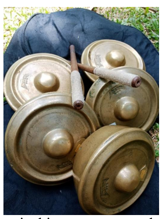
Fig. 1 Talempong , one of the musical instruments used to accompany the randai

The form of the randai performance presented by the randai group Mudo Barapi adapts to the current situation. The Mudo Barapi randai group has recently appeared with randai creations, but will still perform randai traditions if there is a request. This is also a strategy so that the art of randai has a place in society. Traditional randai performances with performance duration for hours tend to be boring for today's society, especially the younger generation. The randai creation performed by Mudo Barapi is packaged more attractively with a shorter duration of time, but still retains the main and supporting elements of the randai itself. The form of randai performances is created in the form of movements with faster, tempo but galembong more varied, dialogue and stories are shortened in such a way but still maintain the storyline. The musical instruments used in the randai performance by the Mudo Barapi group are talempong pacik, gandang, saluang, pupuik, bansi, tansa and jimbe. These musical instruments are played alternately from the start of the randai performance to the end. While the instrument musical used when accompanying the dendang performed by the dendang artist, usually is the saluang or bansi but still adapts to the dendang sung.