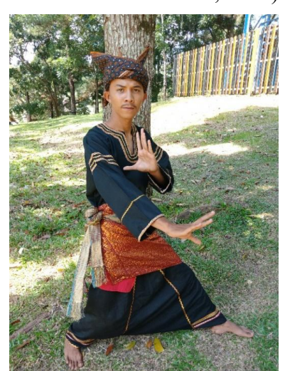
Fig. 2 The costumes used in the Randai performance (Doc. Astri Novrita Nababan, 2020)

The makeup and costumes used in the Mudo Barapi randai performance adjust to the role played. Male players usually wear taluak balango or guntiang cino , sarawa galembong , sesampiang , and deta . For legaran players, they usually wear a black colored galembong, while the color of the clothes adjusts. For female players, usually baju